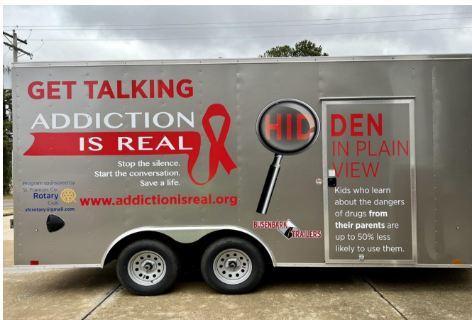
St. Francois County Rotary Hidden in Plain Sight Trailer