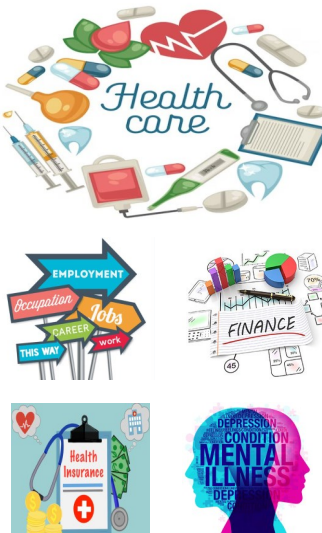
St. Francois County Ambulance District